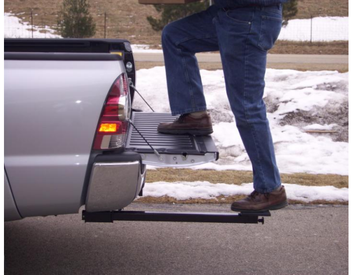
DEBO Step Extended for use with tailgate down.

Tools required for Installation: Wrenches or sockets, \frac{3}{4} " , 2 required.