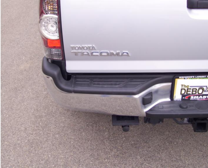
DEBO Step Installed, Stowed Position

Installation Instructions for DEBO Step Model 50400 Fits 05-12 Toyota Tacoma, With Factory Hitch or Equivalent.