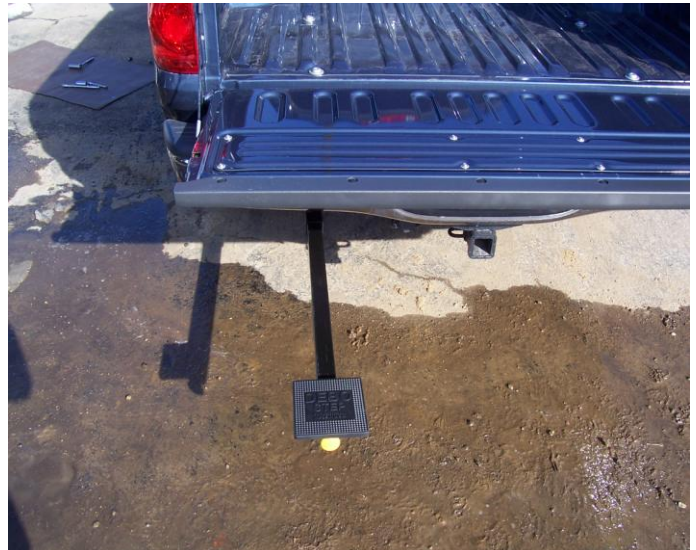
DEBO Step Extended for use with tailgate down.

Tools required for Installation: A box end wrenches or sockets to fit bolt head and nut.