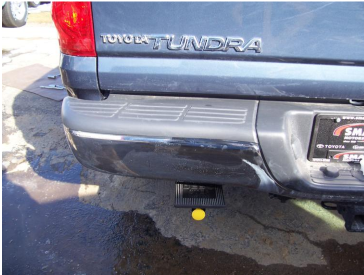
DEBO Step Installed, Stowed Position (Latch knob is black, yellow shown)

Installation Instructions for DEBO Step Model 50100 Fits 03-07(old body) Toyota Tundra, with a hitch.