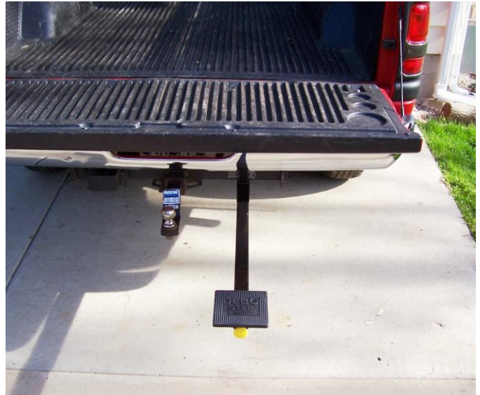
DEBO Step Extended for use with tailgate down.

Shown mounted on right side, can mount on left.