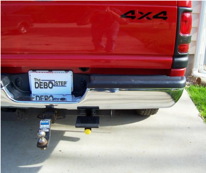
DEBO Step Installed, Stowed Position

Shown mounted on right side, can mount on left.