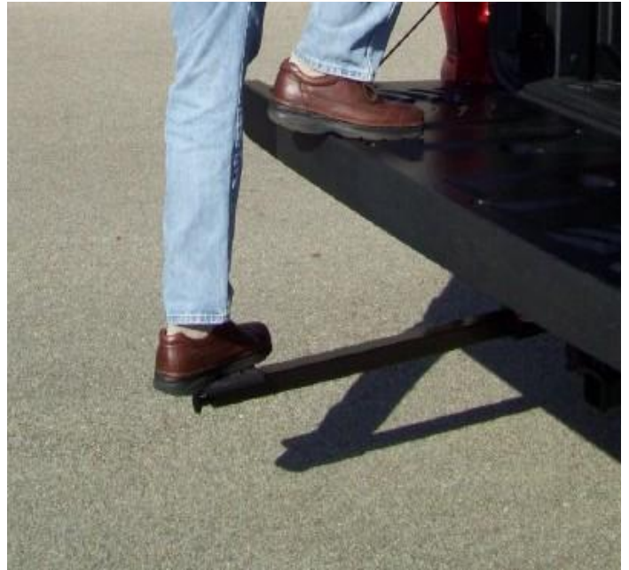
DEBO Step Extended for use with tailgate down.

Tools required for Installation: 1) Deep well socket, 21mm (13/16"), short extension, and handle, ratchet helpful. 2) Box or open end wrench, 21mm (13/16").