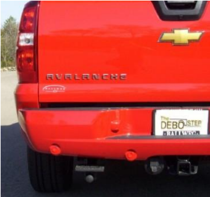
DEBO Step Installed, Stowed Position

Installation Instructions for DEBO Step Model 10701 Fits 02-12 Chevy Avalanche, With Factory Hitch or Equivalent