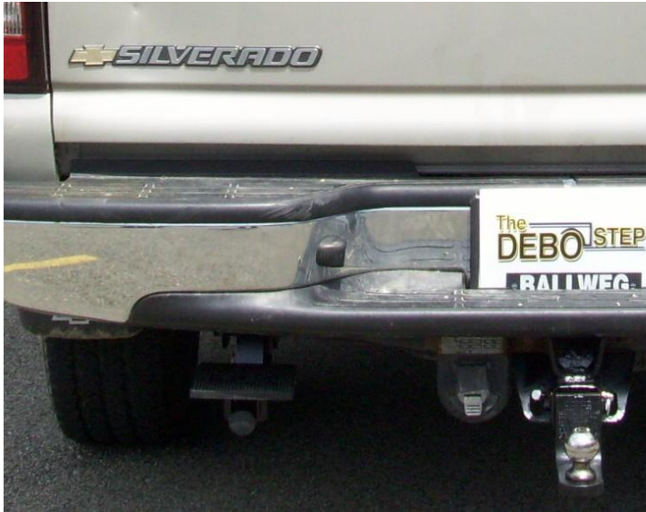
DEBO Step Installed, Stowed Position

Installation Instructions for DEBO Step Model 10301 Fits 99-10 Chevy/GMC 2500/3500 Long Bed, With Factory Hitch or Equivalent.