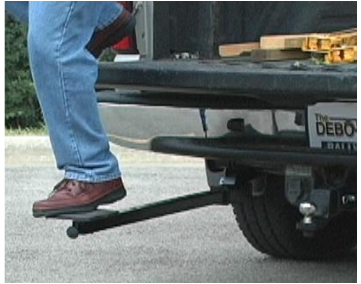
DEBO Step Extended for use with tailgate down.

Tools required for Installation: 1) Deep well socket, 21mm (13/16"), short extension, and handle, ratchet helpful.(use for Step 1) 2) Box or open end wrench, 21mm (13/16"). (use for Steps 1, 2 & 3) 3) Regular socket, 21mm (13/16"), short extension, u-joint, and handle. (use for Steps 2 & 3)