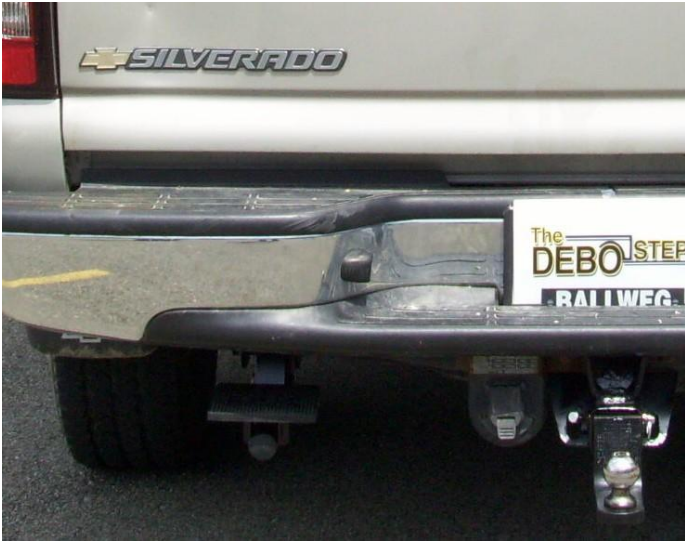
DEBO Step Installed, Stowed Position

Fits 99-10 Chevy/GMC 2500/3500 Short Beds, With Factory Hitch or Equivalent.