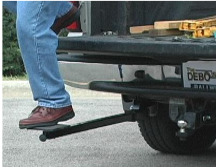
DEBO Step Extended for use with tailgate down.

Tools required for Installation: 1) Deep well socket, 21mm (13/16"), short extension, and handle, ratchet helpful.(use for Step 1) 2) Box or open end wrench, 21mm (13/16"). (use for Steps 1, 2 & 3) 3) Regular socket, 21mm (13/16"), short extension, u-joint, and handle. (use for Steps 2 & 3)